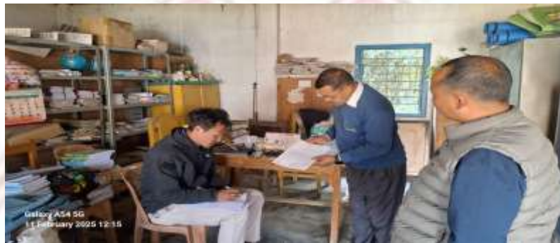
Visit at Yurembam Upper Primary School