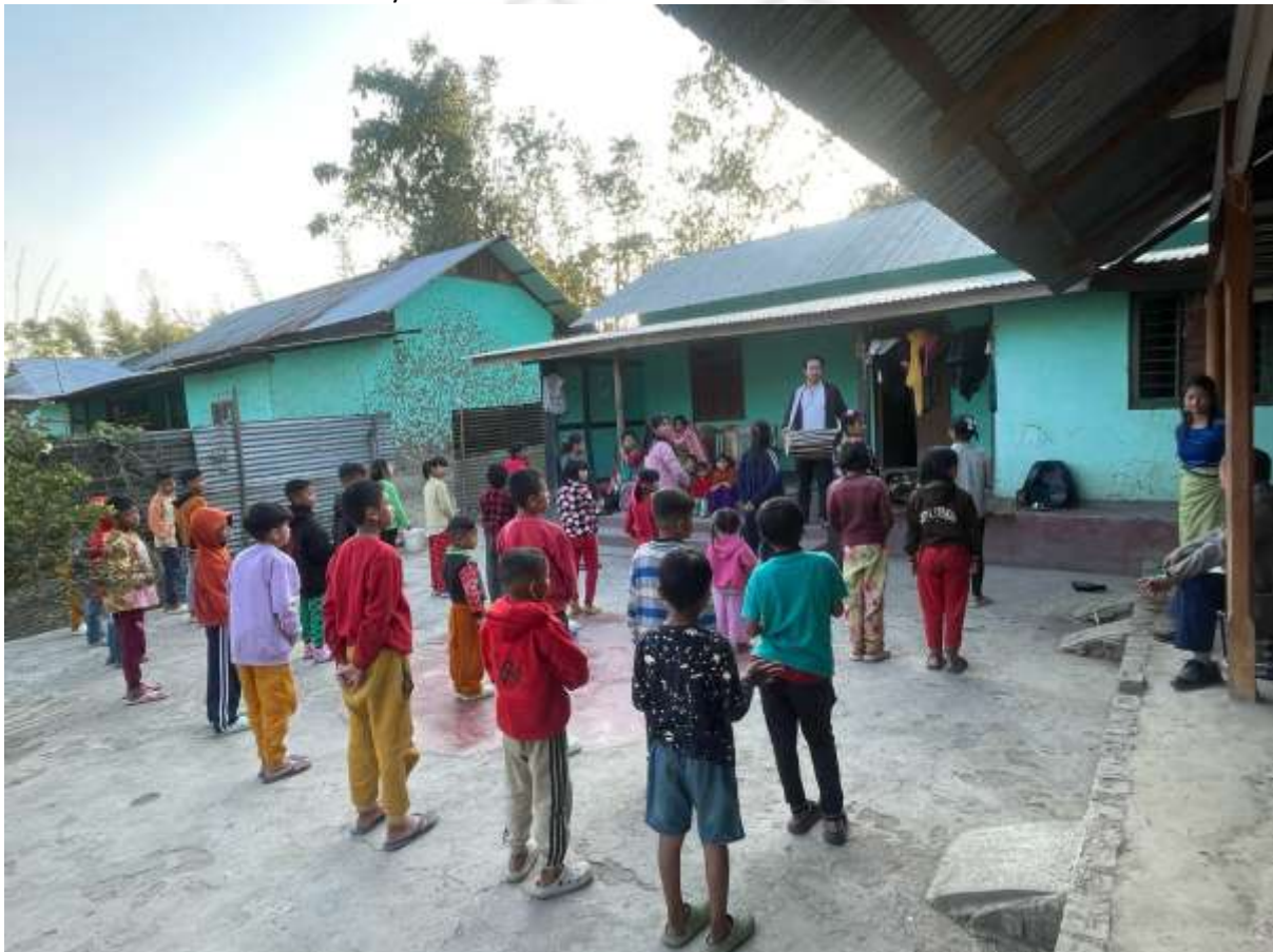
Dance Class at Ngairangbam Center