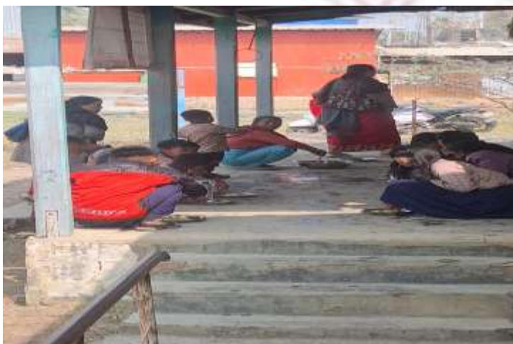
Mid-Day Meal at the Takyel Khongbal Upper Primary School.