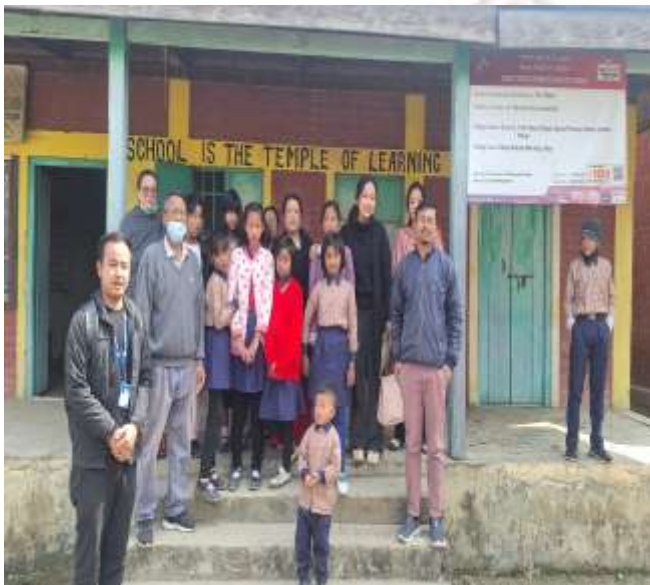
Visit at Takyel Khongbal Upper Primary School, 11 th Feb'25