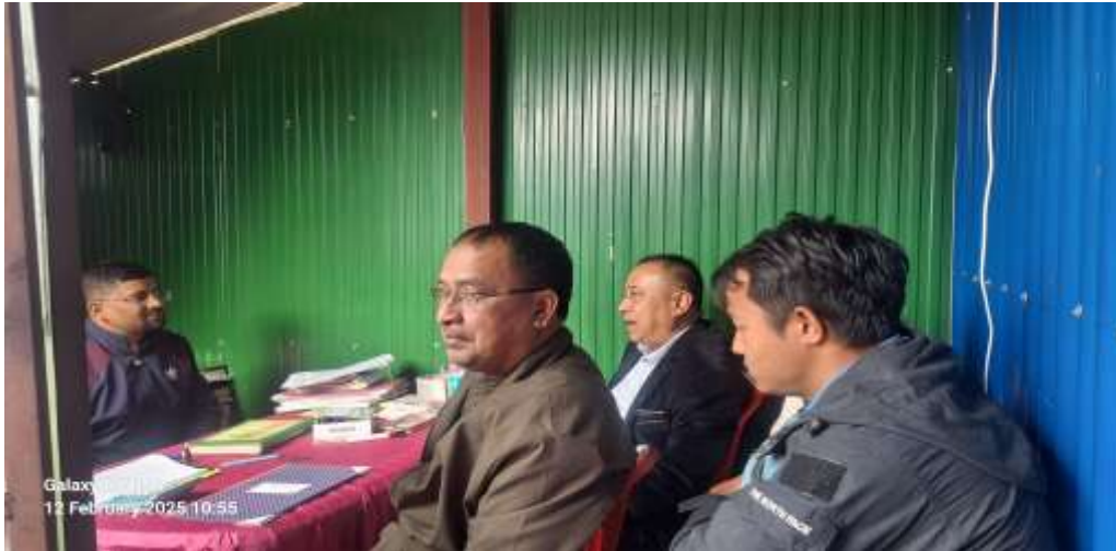
Meeting with the Principal of at the Good Shepherd Academey, New Keithelmanbi