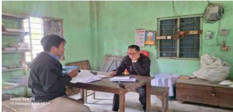
Visit at Patsoi Yaorang Upper Primary School

(Heinoupok, Maklang, Ngairangbam, Thaoroijam and Salam) under Imphal West District, we are now aiming to working with school in our operational area to reach out maximum children and given them support. We are in the process to finalize schedules and commence the classes.