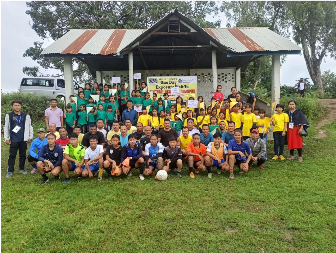
Langthabal Football Ground