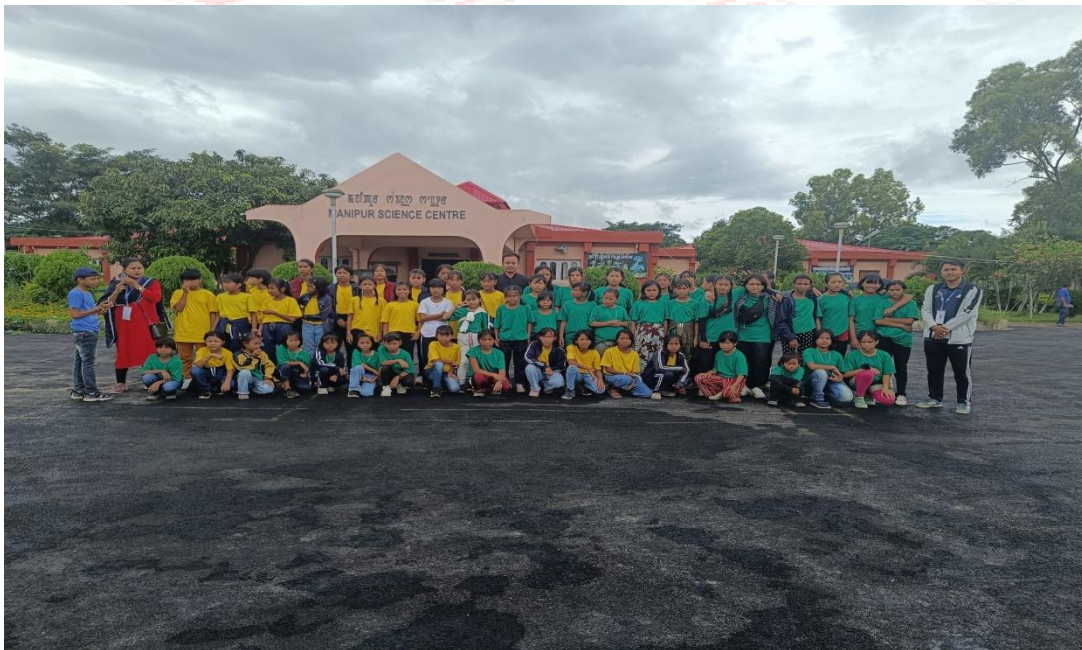
Manipur Science Centre